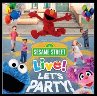
WEDNESDAY, JAN. 22 - SUNDAY, FEB 2 FOX THEATRE