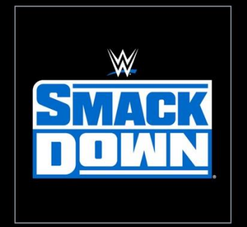
FRIDAY, MARCH 13 LITTLE CAESARS ARENA