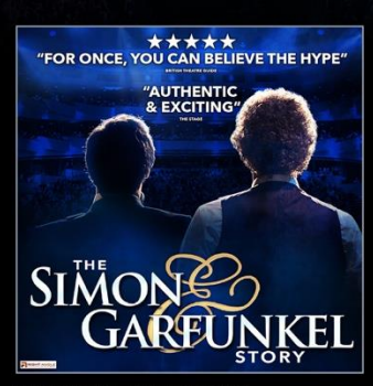
SATURDAY, FEBRUARY 8 FOX THEATRE