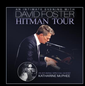
FRIDAY, MAY 8 FOX THEATRE