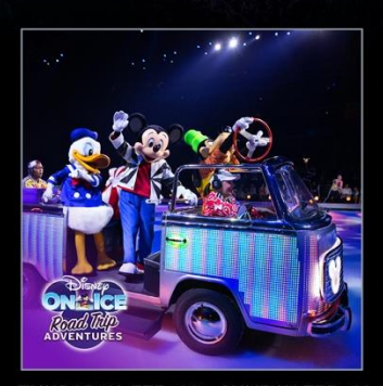
THURSDAY, FEB. 13 - SUNDAY FEB. 16 LITTLE CAESARS ARENA