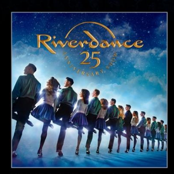
FRIDAY, FEB. 21 - SUNDAY, FEB. 23 FOX THEATRE