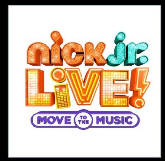
FRIDAY, MAR. 6 - SUNDAY, MAR. 8 FOX THEATRE