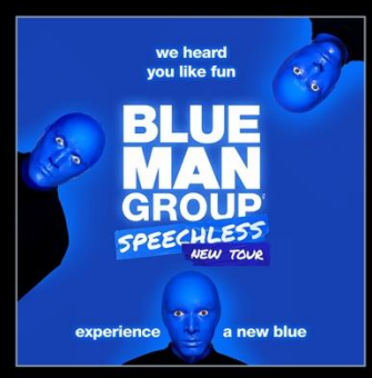
TUESDAY, APR. 7 - SUNDAY, APR. 12 FOX THEATRE