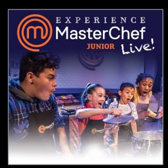
THURSDAY, MARCH 19 FOX THEATRE