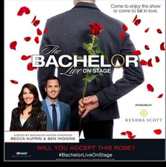
SATURDAY, APRIL 4 FOX THEATRE