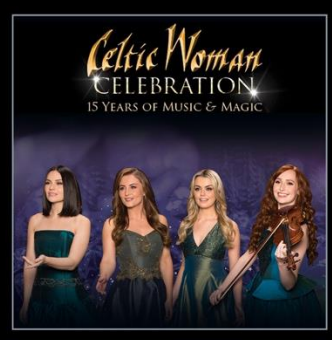
SUNDAY, APRIL 5 FOX THEATRE