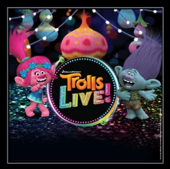
FRIDAY, MAY 1 - SUNDAY, MAY 3 FOX THEATRE